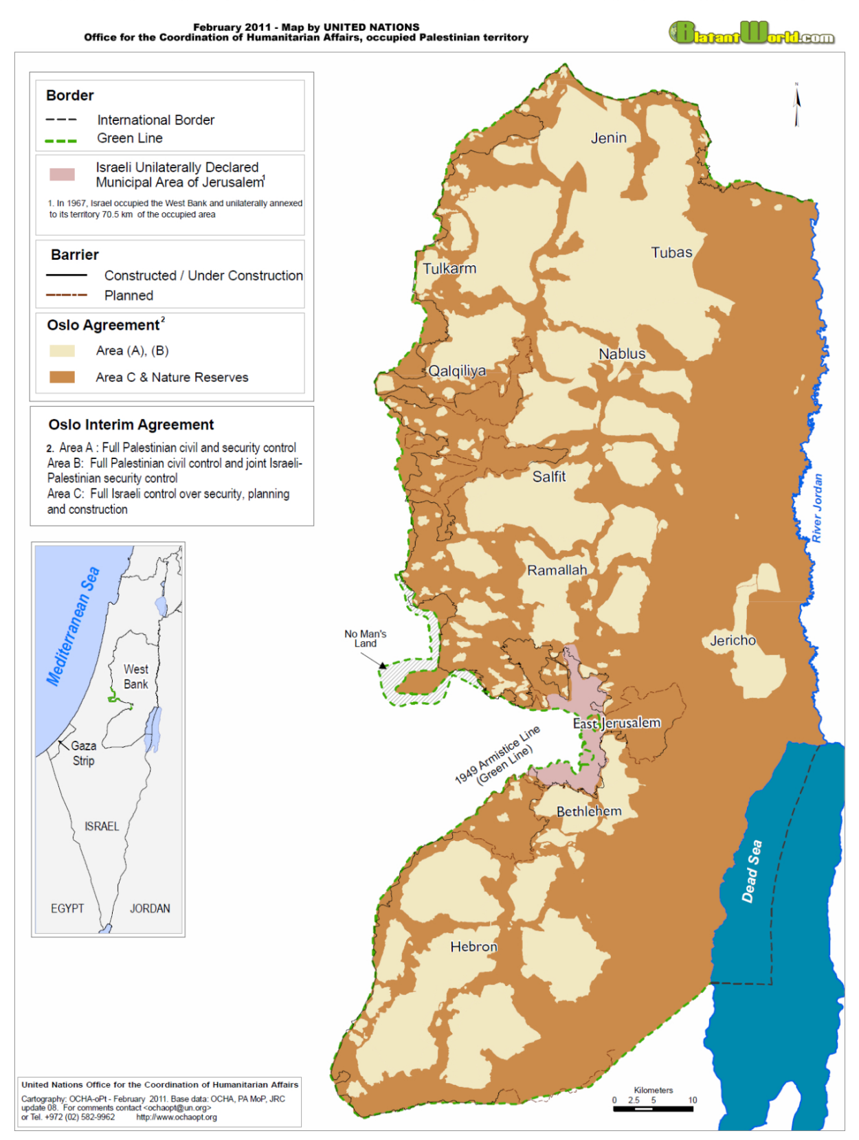
Figure 4.1: Area C