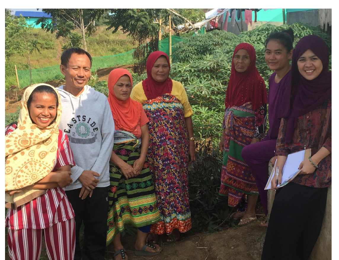
Posing beside their sweet potato and cassava plants, these survivors sustained their communal farm by cultivating new markets and partnerships in nearby Cagayan de Oro. Photo: Kareen Bughaw, 2019